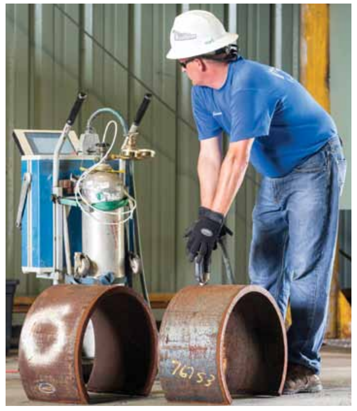
Partek's portable equipment allows the company to conduct ASTM Grade Identification and Grade Analysis at your job site.

limits of metals. Our field metallographic replication services are especially useful to the fabrication industry for rolling metals.