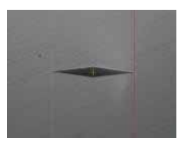
Knoop, 400x magnification